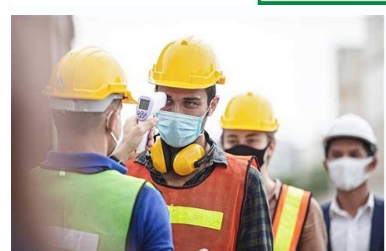
Fire safety risk assessment report. Food safety risk assessment report. Safety risk assessment report pdf. Building fire safety risk assessment report. Guidance on the environmental risk assessment aspects of comah safety reports. Safety risk assessment report example. Safety assessment conclusions report (incorporating quantitative risk assessment).